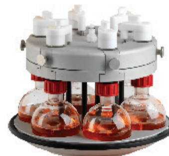
Carousel 6 Plus locates on to the Storm without tools