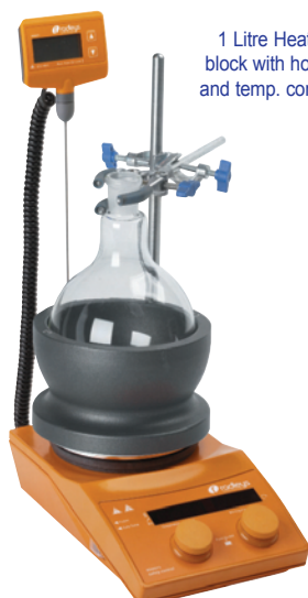
1 Litre Heat-On block with hotplate and temp. controller