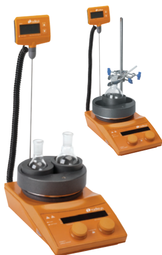
Multi-well Block Holder can accept one or two inserts as required.