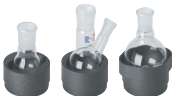
Multi-well flask inserts are available for 10ml, 25ml, 50ml, 100ml & 150ml flasks