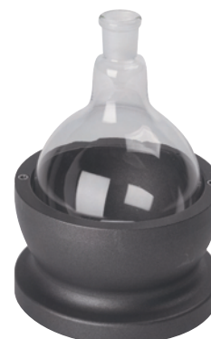
1 Litre Heat-On block