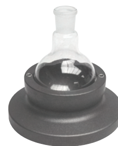
250ml Heat-On block