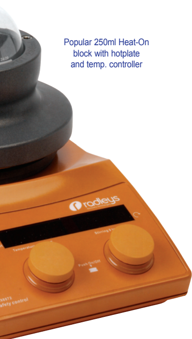
Popular 250ml Heat-On block with hotplate and temp. controller

Each Heat-On block (250ml, 500ml, 1 litre, 2 litre, 3 litre & 5 litre) is a stand-alone product that can be placed directly onto your stirring hotplate - these blocks do not use reducing inserts to accept smaller flasks, thereby maximising heat transfer from a single piece design. All single well blocks feature two probe holes and accept the optional safety lifting handles.