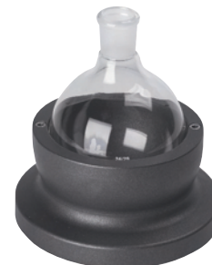
500ml Heat-On block