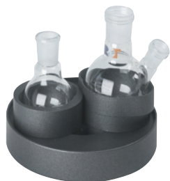
Heat-On Multi-well Block Holder with 50ml and 100ml flask inserts