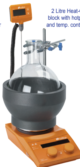
2 Litre Heat-On block with hotplate and temp. controller