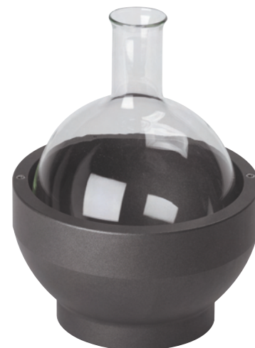
5 Litre Heat-On block