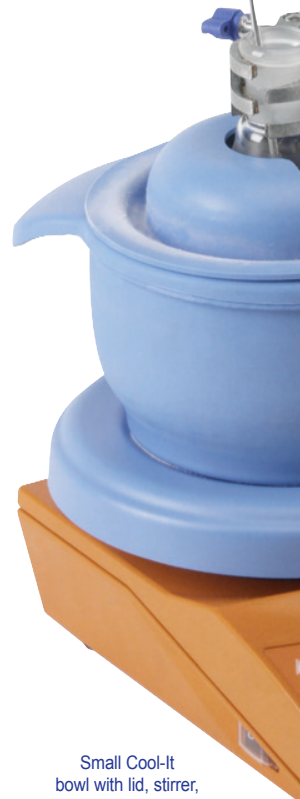
Small Cool-It bowl with lid, stirrer, stand and digital thermometer