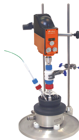
Breeze with 250 ml Heat-On, stand and overhead stirrer