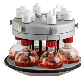
Carousel 6 Plus locates on to the Storm without tools