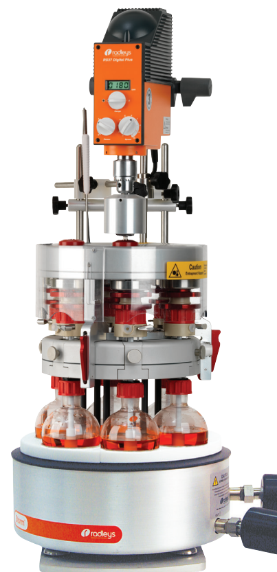
Storm with Carousel 6 Plus, Tornado, overhead stirrer and PTFE insulating plate