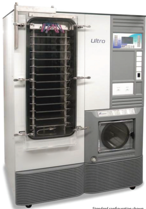
Standard configuration shown.