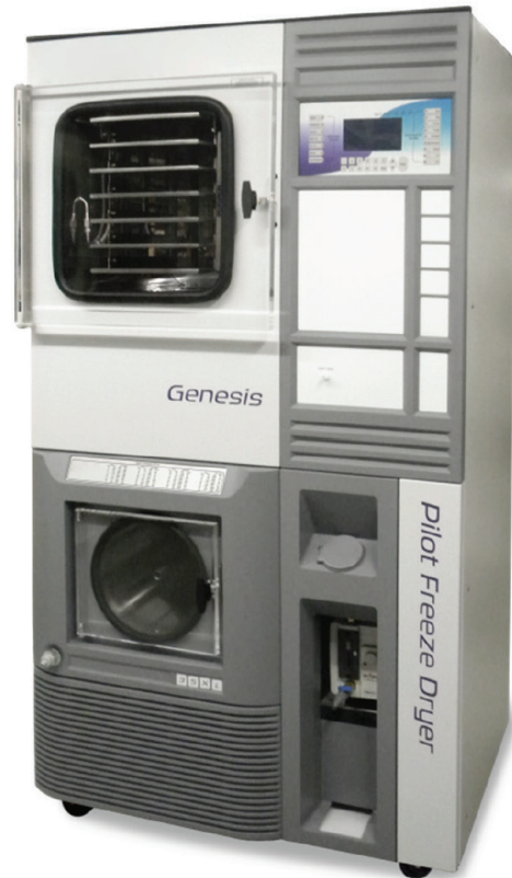
Standard configuration shown.

Note: Other electrical configurations available.